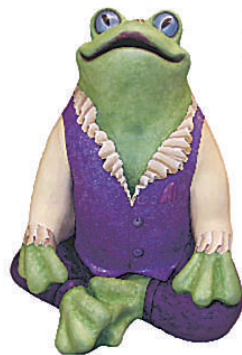
Communities across the country have embraced public art projects similar to Gobble de Art. Frogs Lafayette, Ind.