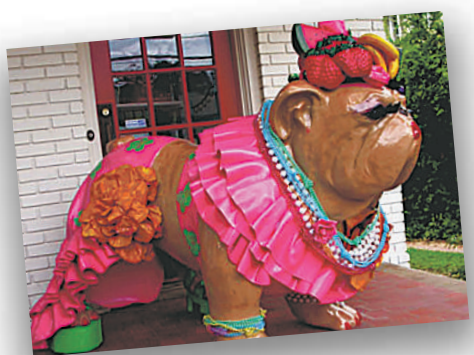
Bulldogs Athens, Ga.